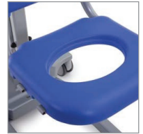
Seat area with large, lockable hygiene opening.