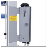
Easy battery access and removal.