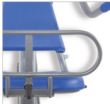
Side rail for increased safety plugs in easily and features safety lock.