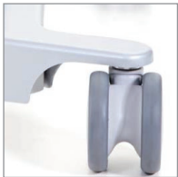
Four high-quality double castors, two of them with brakes, provide easy movement.