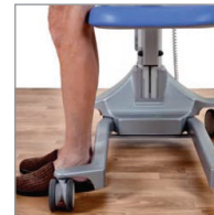
The carrier frame is made from high-quality steel and formed for self-entry.