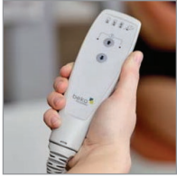
Handheld operation with problem indication and battery level display.