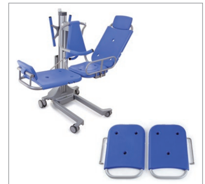
Two removable stretcher lift wings comfortably convert the seat lift into a full stretcher lift. The two modules are easily clicked into an existing safety adapter at the seat tray. Also available with a foot rest. (optional)