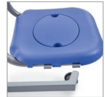
The PUR padding is easily slid onto the stainless steel frame and can be removed at any time.