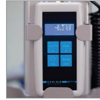
Digital patient scale. (optional)