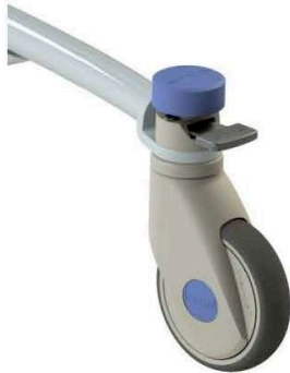
Figure 1 Wheel