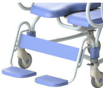
Figure 4 Foot support