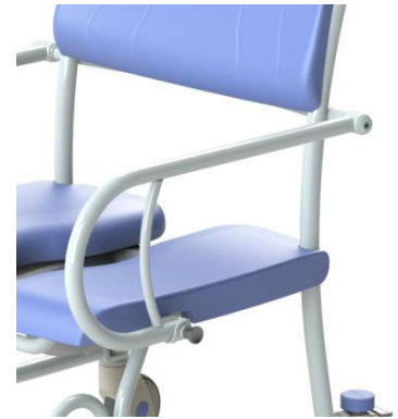
Figure 3 Armrest