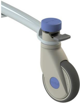
Figure 1 Wheel